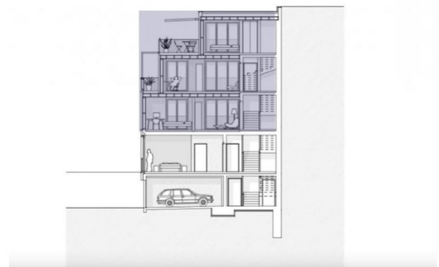
Cross section of the extension