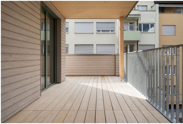
Terrace 3rd floor