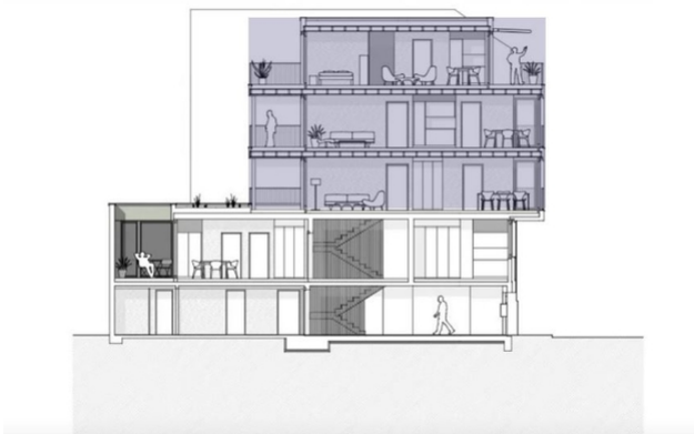
Longitudinal section of the extension