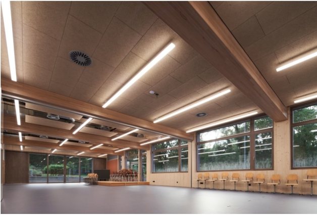
Multipurpose room with the beech wood joists and the folding partitions