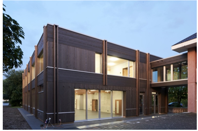
West facade with the seven meter wide window front and the passerelle into the old building