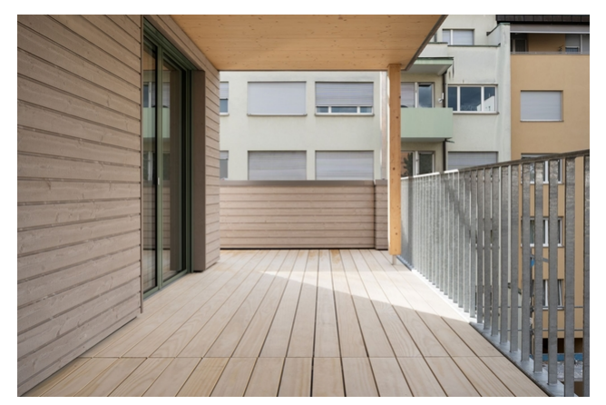
Terrace 3rd floor