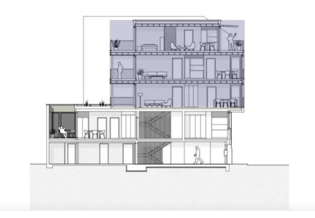
Longitudinal section of the extension