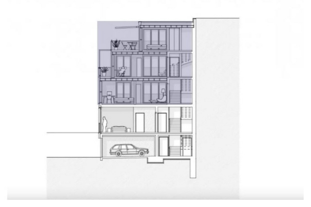
Cross section of the extension