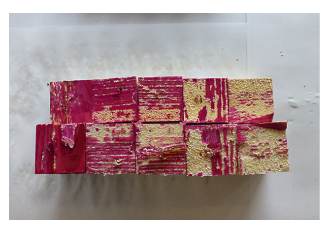
Broken surface after coloring