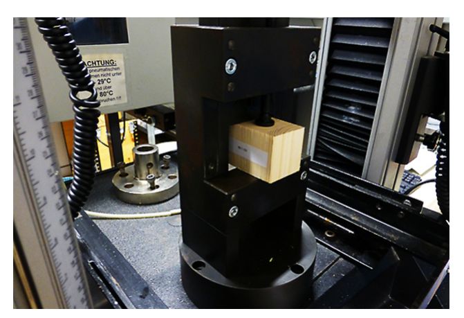
Test specimen for shear testing