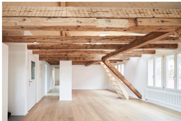
Room (with ascent)