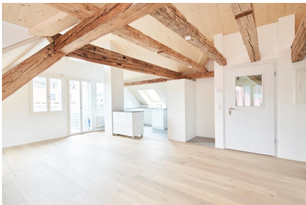
Room with kitchen