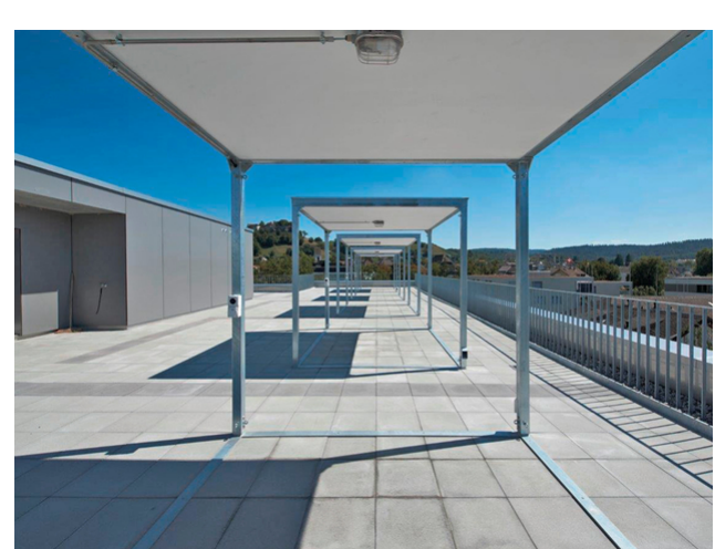
Spacious roof terrace with view of Lenzburg