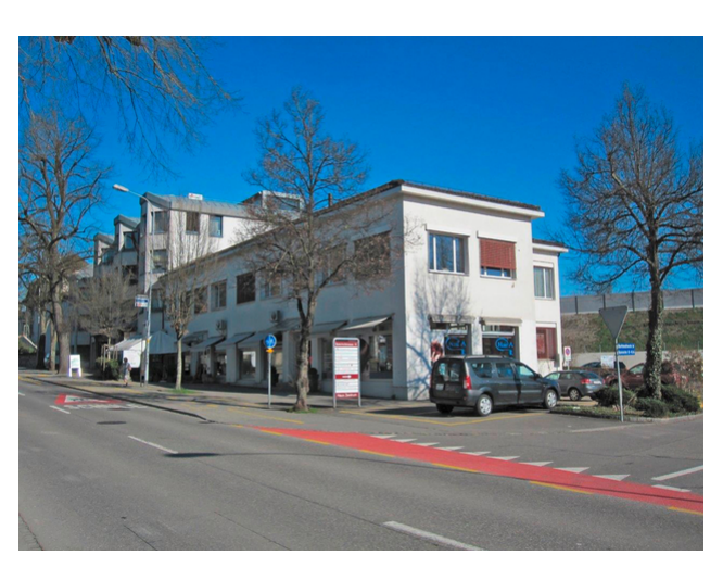
The commercial building before the extension