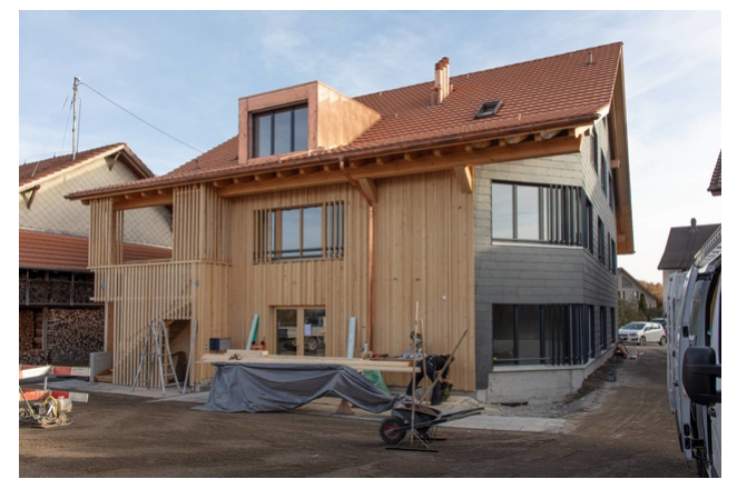
Fire protection facade to the neighboring house