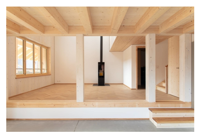
Interior view living room