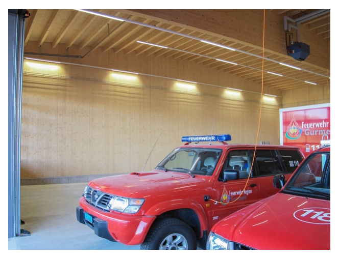
The new garage offers plenty of space for all kinds of vehicles...