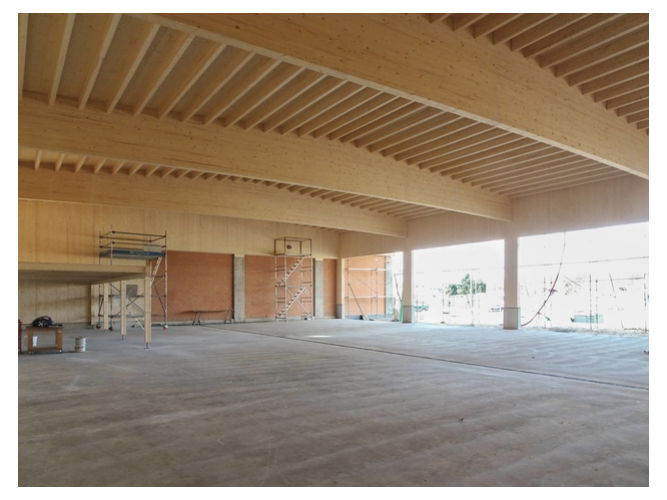
View inside: The 25 meter long trusses support the hall roof