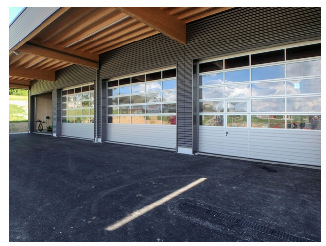
The canopy of the new garage is a proud 5 meters wide