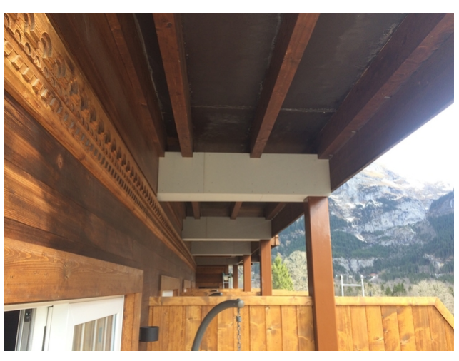
HEB beam clad