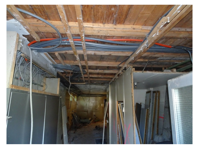
Ceiling before retrofitting