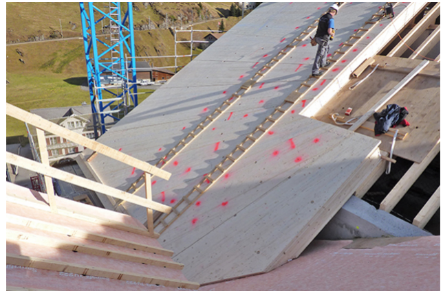
Assembly of roof elements on the primary structure