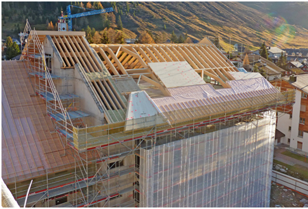
Assembly of trusses and roof elements building H3