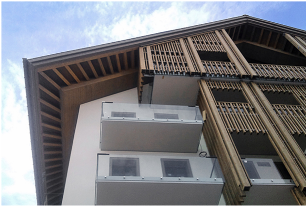
Detail view canopy corner