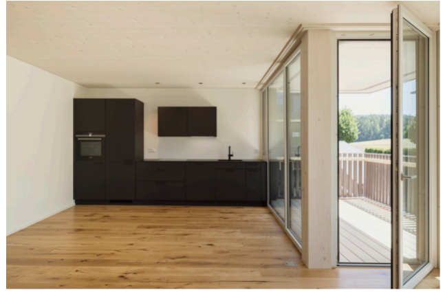
TS3 assembly in its finished state