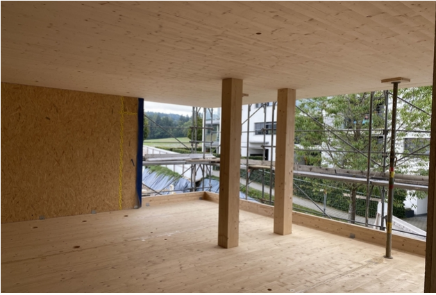
TS3 construction during the construction phase