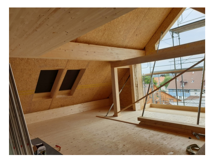
Construction phase attic