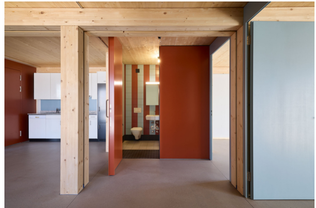
Striking wooden structures in the interior design