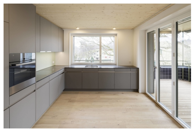
Insight into the kitchen with visible wooden ceiling