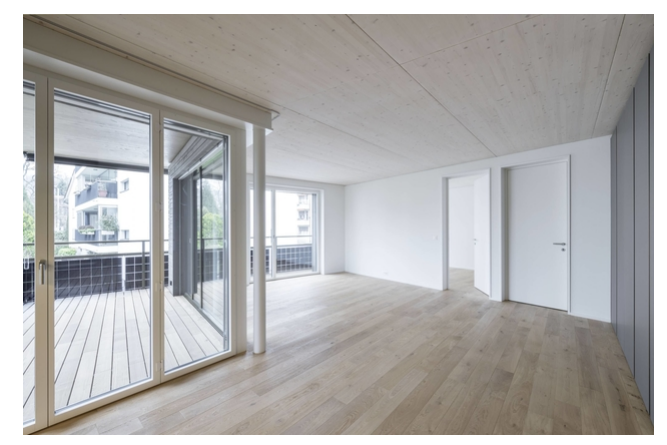
Spacious terrace with ground level exit