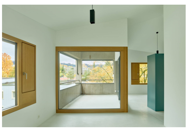
View to the balcony