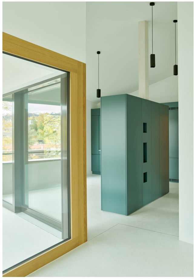
Passage living room - kitchen