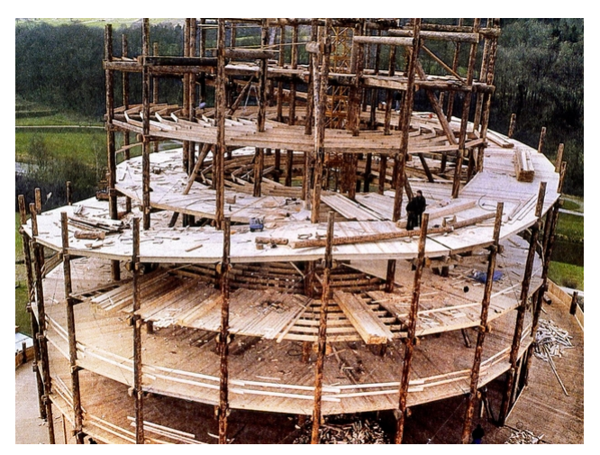
Tower in shell