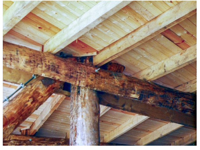
... and the application on the construction