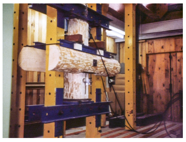
Development and testing of the connection part tong-post...

For the connection of these tongs, a new type of heavy-duty fastener had to be developed that had to meet high requirements in terms of load-bearing capacity, flexibility (round timber) and low-cost procurement. In Menig AG's own laboratory, a number of different connection sizes were tested and optimized - after prior mathematical verification - so that finally 3 types with 50, 100 and 150 kN payload were available for the design. The bracing consisted of 4 elements: Radial brace frames, Circumferential ramp, Tangential bracing, Floor formwork as bracing. In addition to the high stresses in the logs, the deformations and pendulum movements in the tower were decisive for the dimensioning of the components.