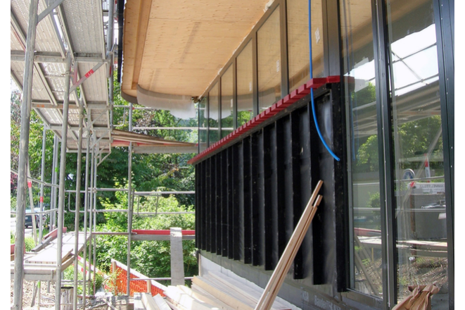
Overhanging floor slab in the area of the entrance