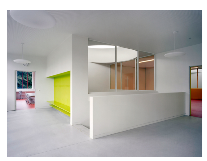
Interior view; Photo: Roger Frei, Zurich

In order to design the large cantilevers and distribute the forces to the pile foundations, high beams made of glulam were inserted in the roof as well as in the floor slabs. Another highlight were the round skylights: due to the filigree support in four points, the skylight roof seems to float on the surrounding light band.