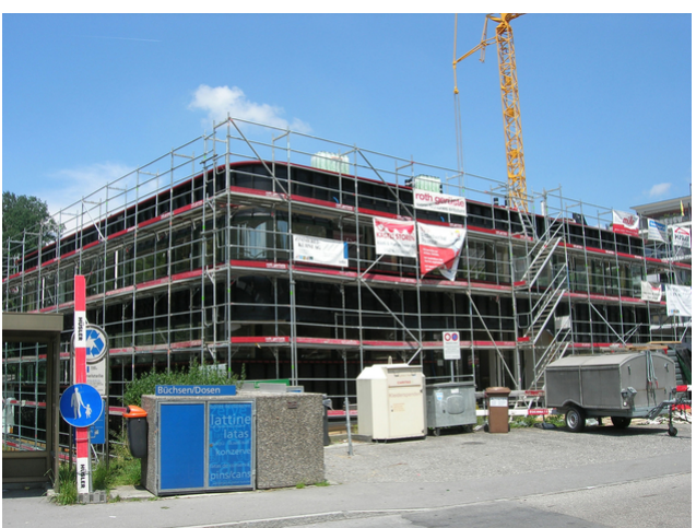
Exterior view from Büttenbergstrasse