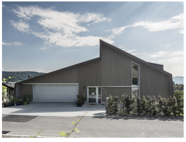
The garage directly above the bedroom made high demands on sound insulation