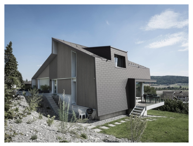
Special shape: The roof extends to the ground on one side