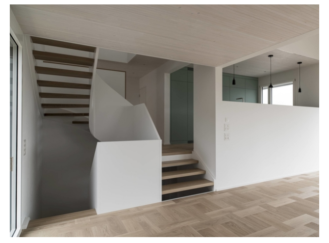
Slightly offset floors: live on different levels