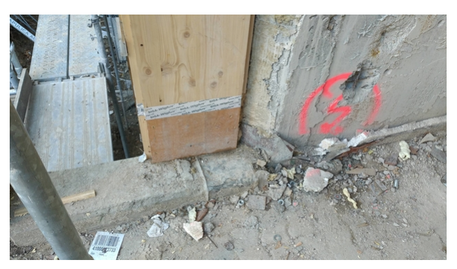
Connection of the wooden structure to the existing concrete elements