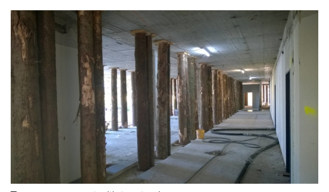
Temporary support with tree trunks