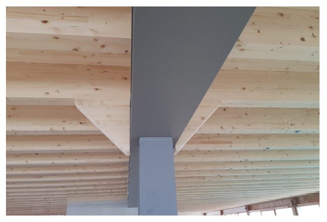
Combination of steel structure and wood construction