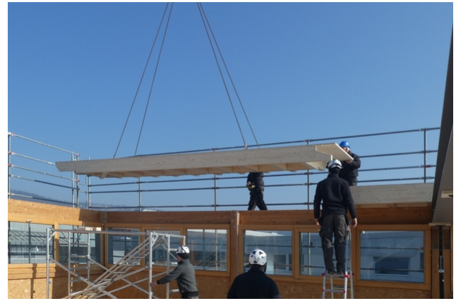
Installation of a roofing element