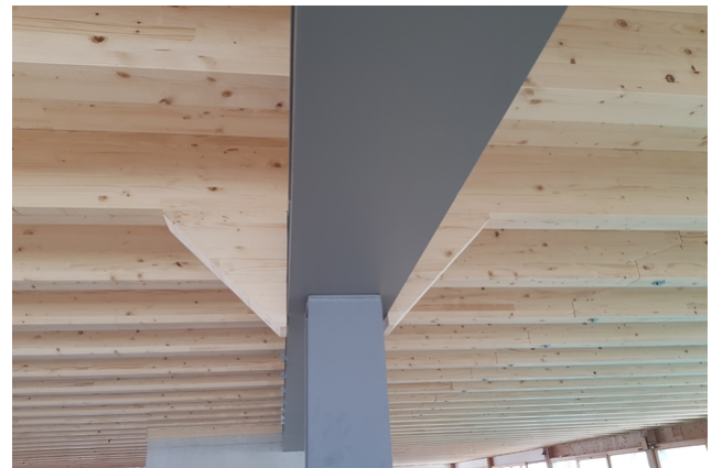
Combination of steel structure and wood construction