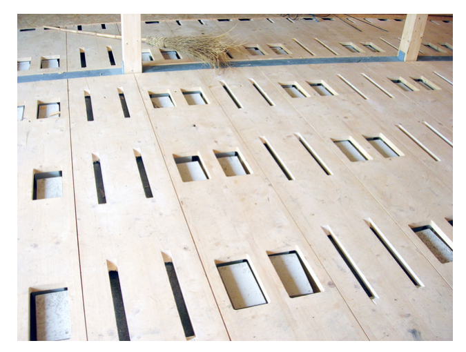
Filling the opening signature silence