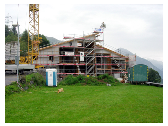
Shell of the building