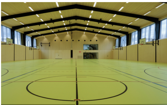
Interior view after renovation