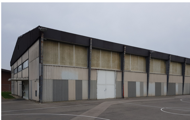
Gymnasium before renovation