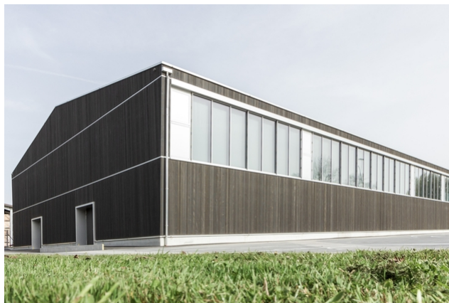
Gymnasium after renovation