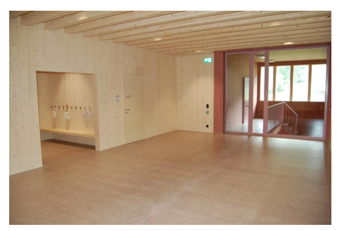
Staircase with wardrobe