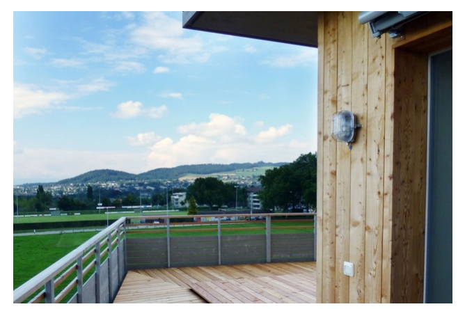
House C terrace with view