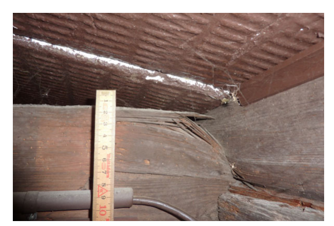
Support for wine cellar beams before renovation