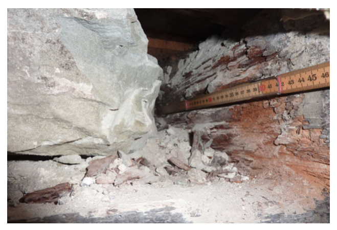
Ceiling beam support in the outer wall in the wine cellar before renovation