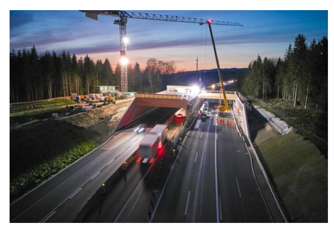
Assembly work with single lane traffic