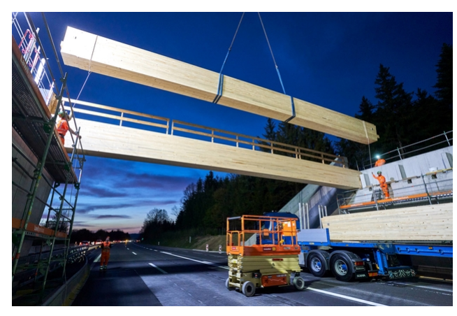
...and are placed in one piece on the concrete foundations.