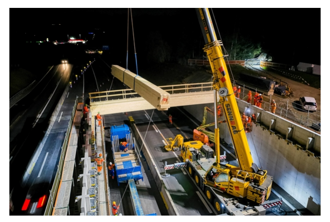
The girders weigh about eight tons...