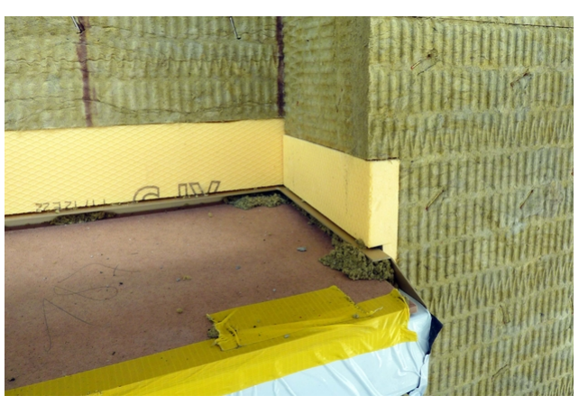
Detail insulation on window sill