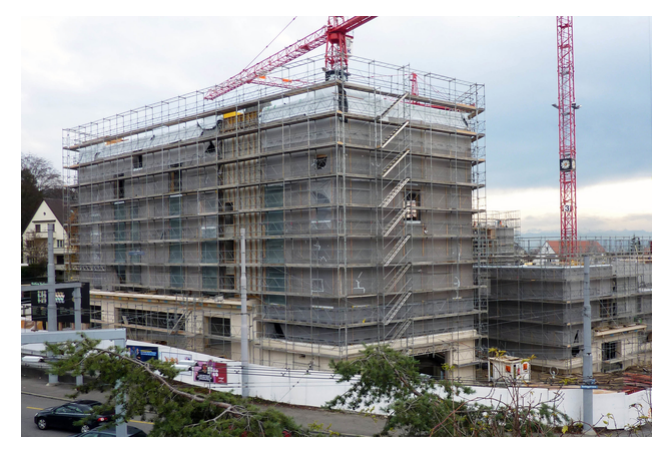
Apartment house with construction site scaffolding