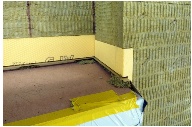
Detail insulation on window sill