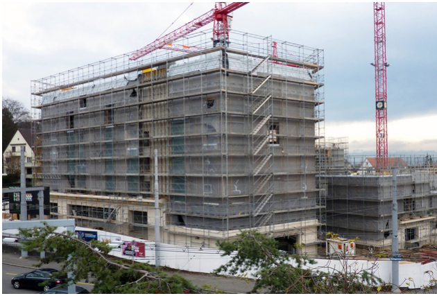
Apartment house with construction site scaffolding